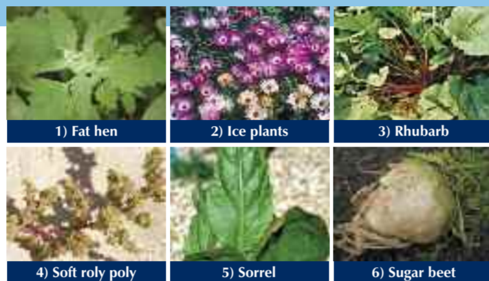
Image sources: 1) http://img.ggdht.com/237Bt56ggg1UBnZuj59k1AAAAA4AFHk2HGMI_AXIQMWHl1%252520SPinact%252520%252520Chenopodium%252520album%252520- web_thumb%2525683%25255D.jpg?imgmax=800 2) https://apps.rhs.org.uk/plantselectorimages/detail/WSY004816_2840.jpg 3) https://upload.wikimedia.org/wikipedia/commons/8/8e/Photinia_fraseri_B.JPG 4) https://apps.rhs.org.uk/plantselectorimages/detail/WSY0036699_5112.jpg 5) https://apps.rhs.org.uk/plantselectorimages/detail/WSY003342_4322.jpg 6) https://apps.rhs.org.uk/plantselectorimages/detail/WSY0041942_14593.jpg

Specific treatment is vitamin B preparations and 20% calcium borogluconate, both given slowly intravenously. The dose of the 20% calcium borogluconate is 30ml for a small sheep or pygmy goat, 60ml for a normal-sized sheep or goat and 80ml for a SAC.