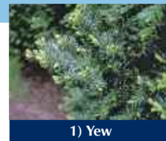
Image sources: 1) https://apps.rhs.org.uk/plantselector/images/detail/W5Y0024056_12129.jpg

There is no realistic treatment. However, recent observations (Stevenson 2010) and (Swarbrick 2010) indicate that although yew is extremely toxic to cattle it may not be so toxic to small ruminants.