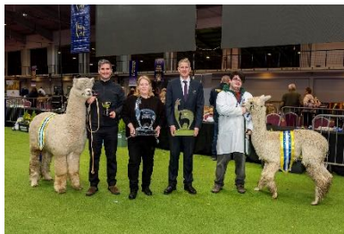
Champions and judges from National Show 2022