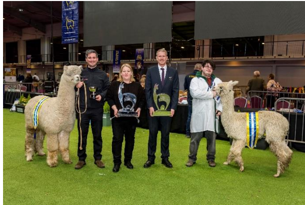
Champions and judges from National Show 2022