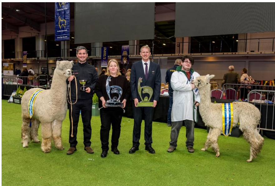
Champions and judges from National Show 2022