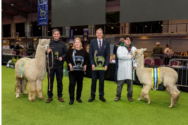
Champions and judges from National Show 2022