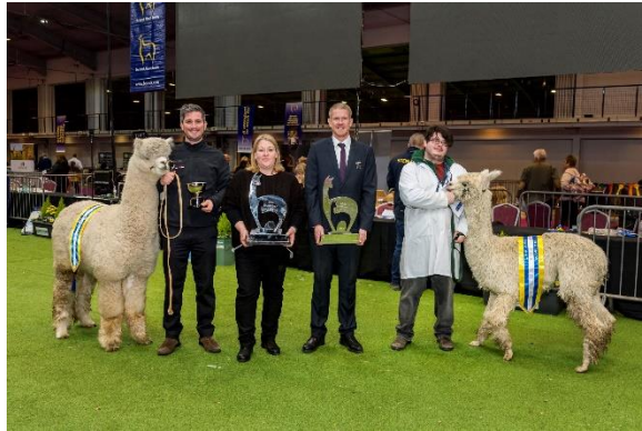
Champions and judges from National Show 2022