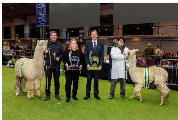
Champions and judges from National Show 2022