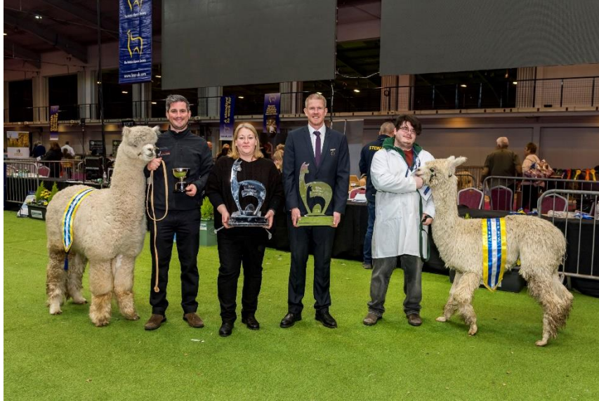
Champions and judges from National Show 2022