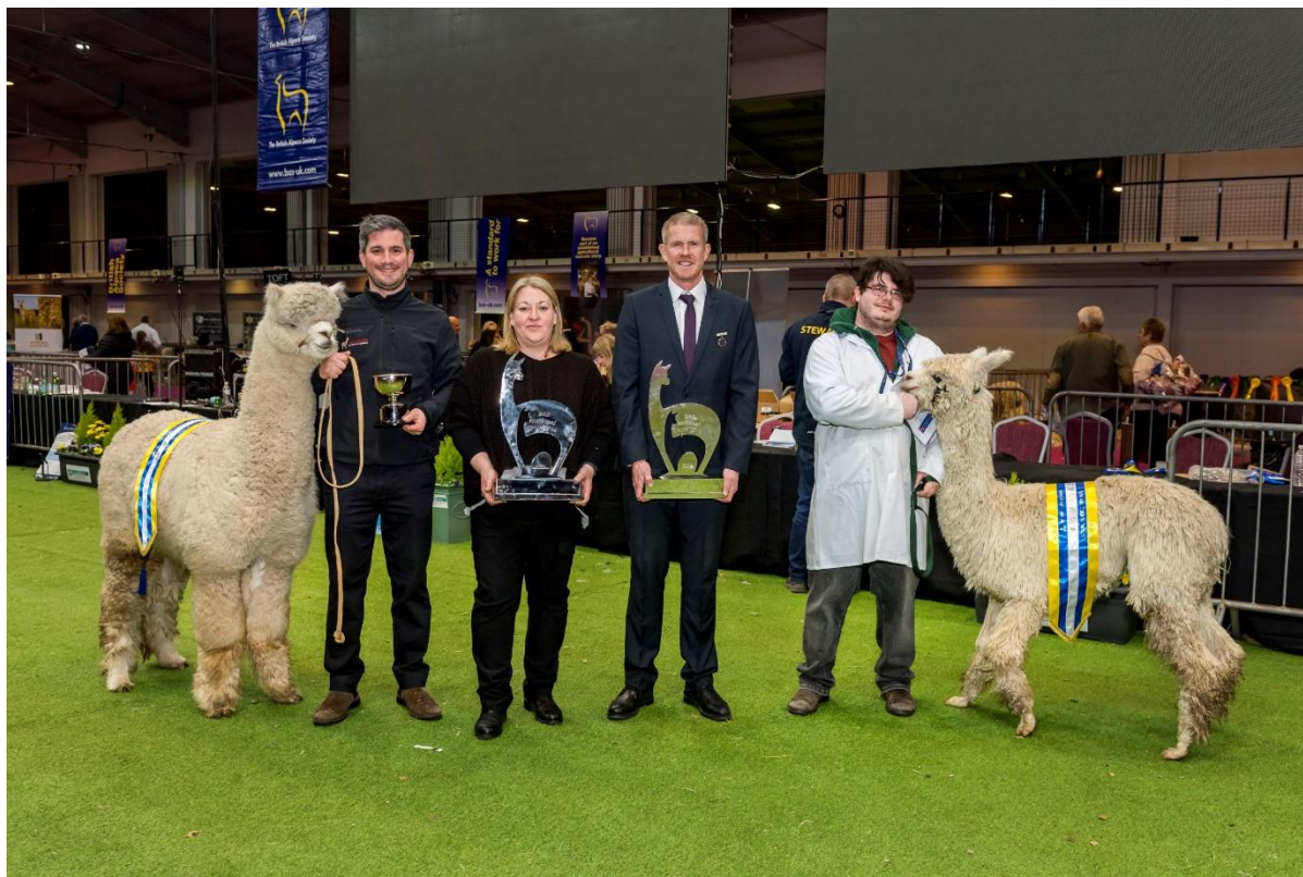
Champions and judges from National Show 2022