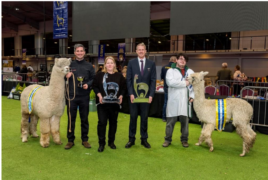
Champions and judges from National Show 2022