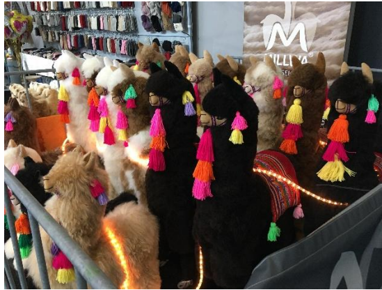
German alpaca merchandise