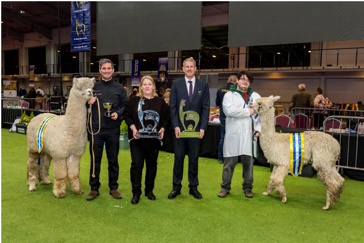
Champions and judges from National Show 2022