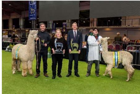
Champions and judges from National Show 2022