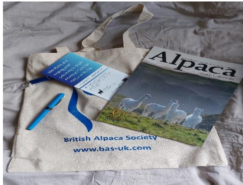
example of "goody bag"