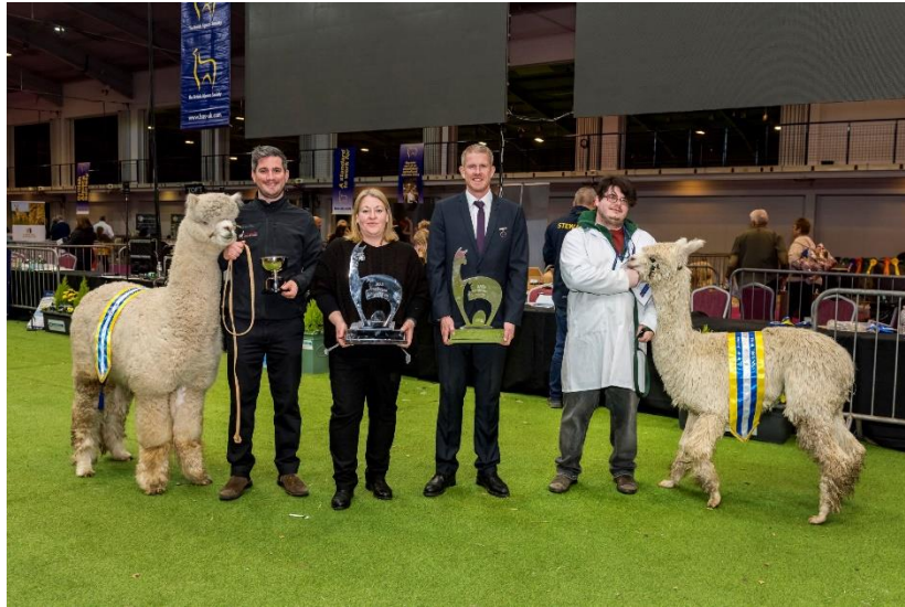
Champions and judges from National Show 2022