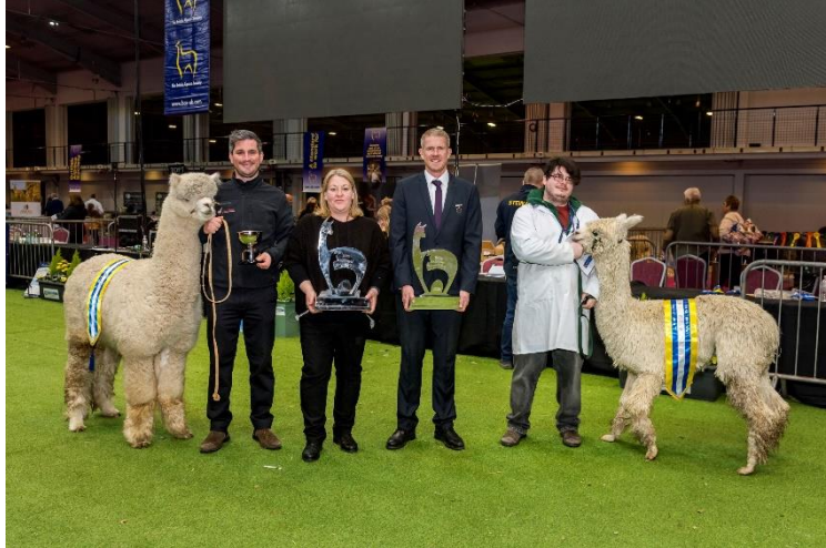
Champions and judges from National Show 2022