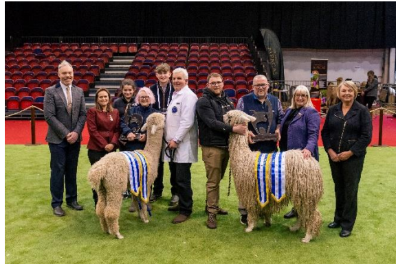
Champions and Judges from National Show 2023