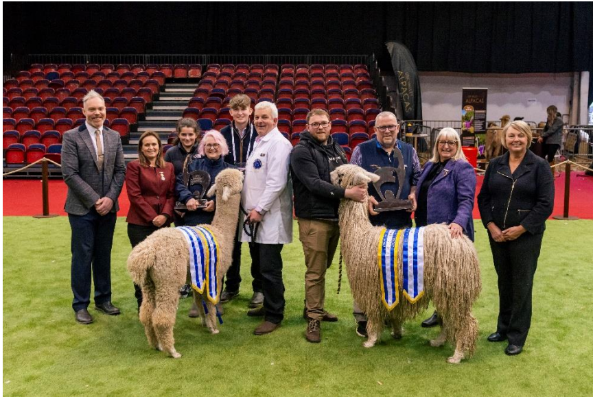
Champions and Judges from National Show 2023