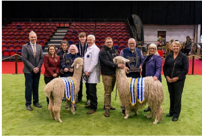
Champions and Judges from National Show 2023