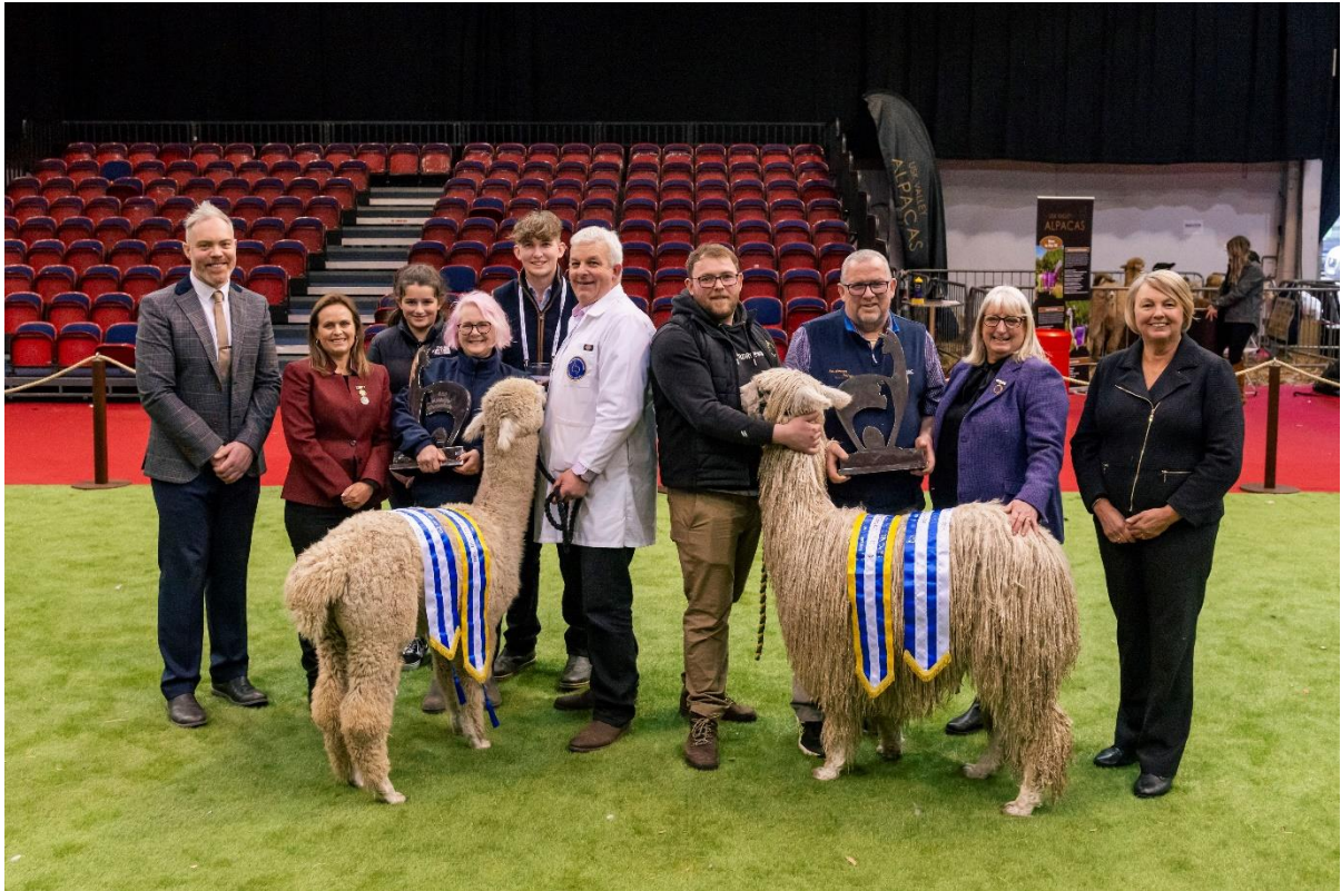
Champions and Judges from National Show 2023