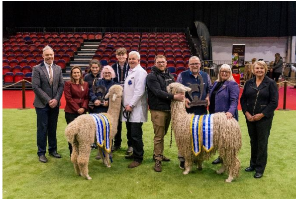
Champions and Judges from National Show 2023