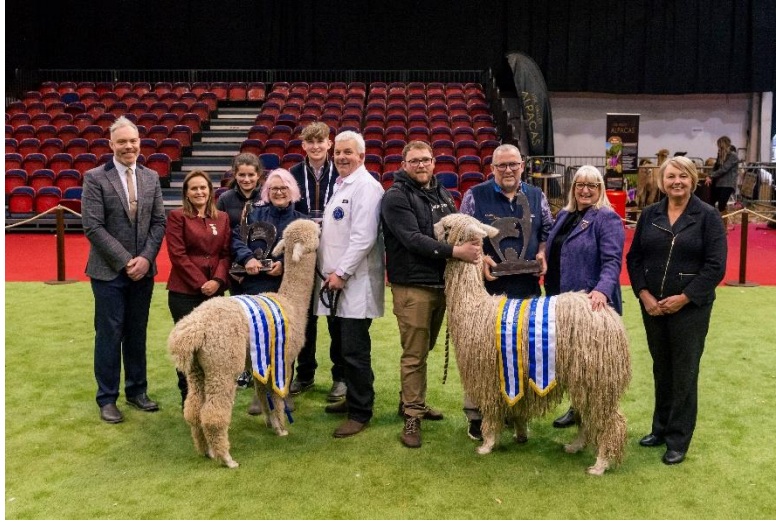
Champions and Judges from National Show 2023